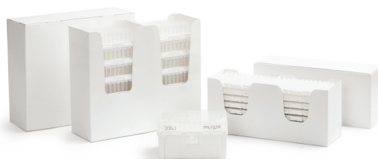
Pipette Tip Reload System