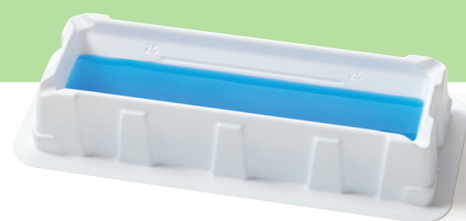
25ml Reagent Reservoir

As with all products in the White Box line, disposable reagent reservoirs are produced in an ISO 9001-2008 certified facility and each lot of product undergoes rigorous QC inspection, including laboratory analysis to certify against the presence of RNase, DNase, Endotoxin (pyrogens), Nucleic Acids and PCR inhibitors.