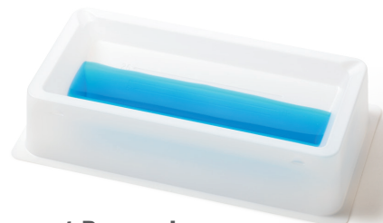
100ml Reagent Reservoir