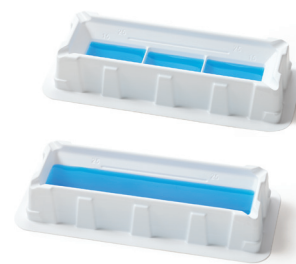
Disposable Reagent Reservoirs