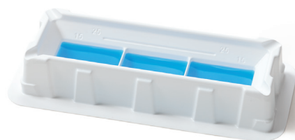
25ml Reagent Reservoir 3-Divided Wells