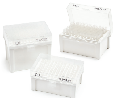
Universal Pipette Tips