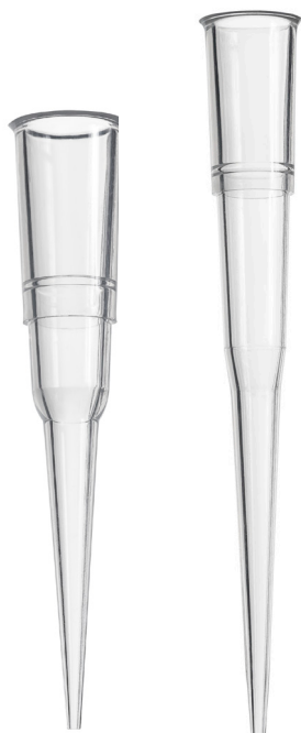
TM-0050-9NC TM-0200-9NC TM-0050-9SC TM-0200-9SC